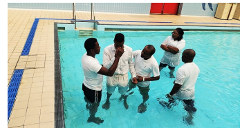
[Various Types of Baptisms (below)]

It is wise for the redeemed to remember the "Living-water," the Holy Spirit (Fire) has been given by the Father to all who believe in Jesus as Savior. Fire-baptized followers are committed to glorify Jesus' way of living day by day. It's a fruit Spirit living within us. We walk with Jesus in obedience to the Father by Faith! May others see His direction in our lives, hear His call and follow Him too.