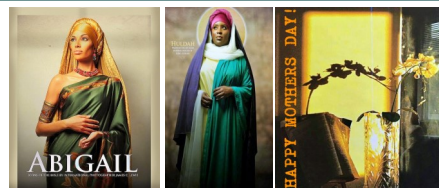
HULDAH — 1 of the 7 Prophetesses (2 Kings 22:14-20; 2 chronicles 34:22-28).