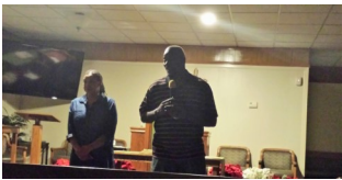
praying at the altar or in the pews.

Members and visitors are welcome to participate in aloud or unspoken