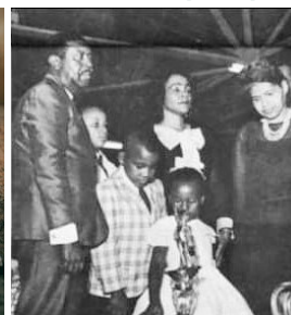
Ralph Abernathy, Rosa Parks, Coretta Scott King and children (after King's death).