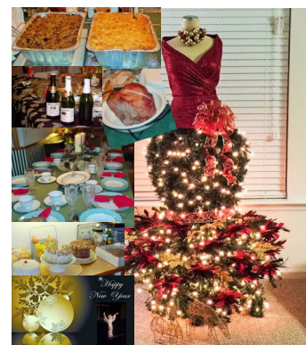
Praise And Worship's Christmas Choir

Ponder This Image! Imagine our sorrowful destiny if the life of Christ had ended with these words, "And God left His creation, which had rejected Him and put Him to death, never to come again." The thought of such a thing is the stuff of nightmares, not Christmas .